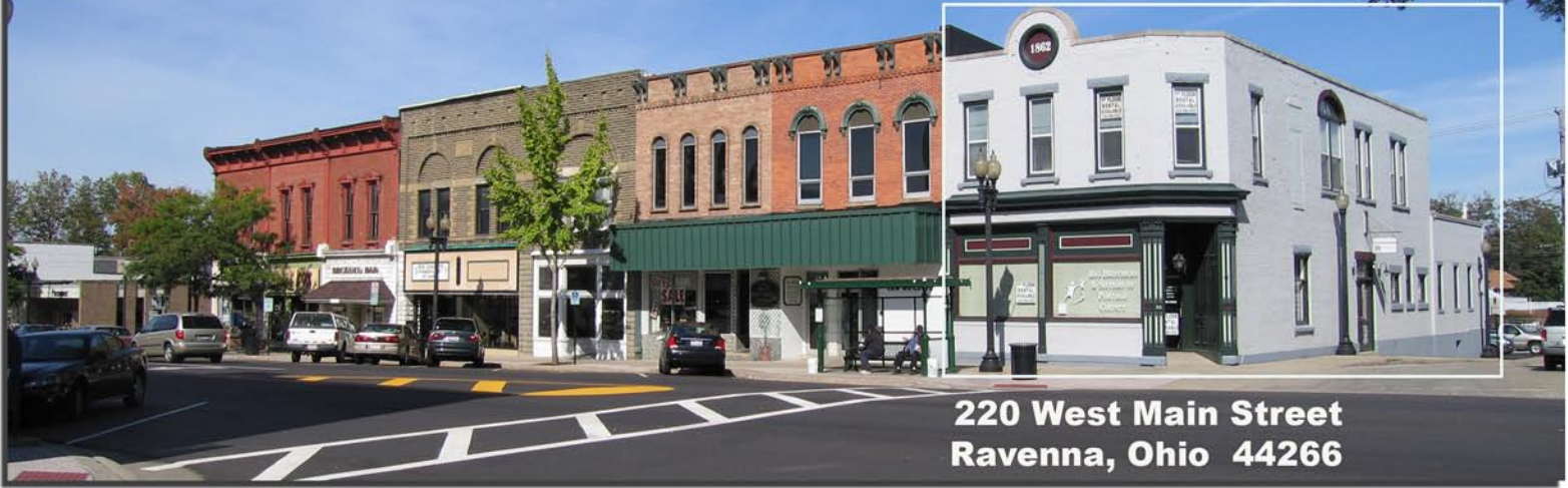
220 West Main Street Ravenna, Ohio 44266