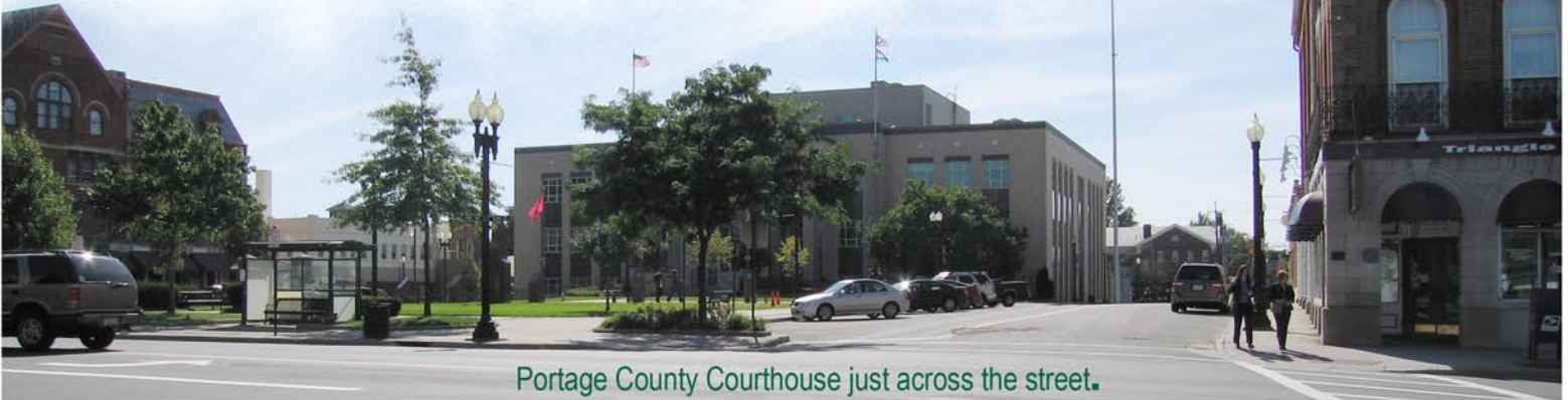
Portage County Courthouse just across the street.